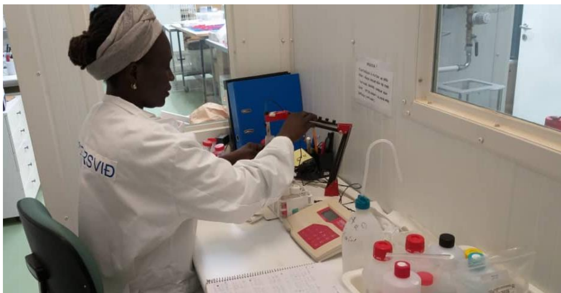
Figure 4. Measuring pH at the laboratory. (Photo: J. Jumaev, 19 July 2019).

Soil pH was measured using a pH meter in a 1:1 soil to deionized water ratio mixture, shaken in a shaker for two hours (Zhang & Fang 2007). The electrical conductivity and nitrate were measured in 1:1 soil to water suspension (Motsara & Roy 2008) with the use of an electrical conductivity meter and nitrate meter.