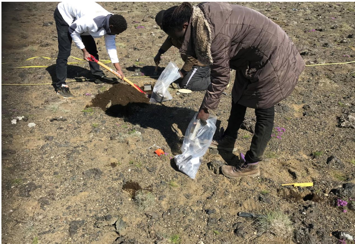
Figure 3. Soil sampling at Kot. (Photo: M. H. Jóhannsson, 1 July 2019).

Soil samples were collected from the site that had been fertilized with bone meal in 2016 and an adjacent untreated control site. Samples were taken from three areas randomly selected from the treated site and the control site (three replicates for each treatment factor). At each of the six spots, a 10x10 m grid was set up. Within each of the 10x10m grids, soil samples were taken with 4.8 cm 3 auger at 0-10 cm depths at 10 randomly selected points. Samples were combined within each replicate and the composite sample used for laboratory analyses. A subsample was taken from each composite sample for determination of moisture content. The rest of each soil sample was air-dried, homogenized and passed through a 2 mm sieve before analysis of the other parameters. For the analysis of bulk density, four undisturbed core samples (1000 cm 3 ) were taken at four randomly selected spots in each replication of both treated and untreated sites. Variables such as C:N ratio, organic matter content, electrical conductivity, nitrate, soil pH, bulk density and water holding capacity were measured in the laboratory. Figure 3 below shows soil sampling at Kot.