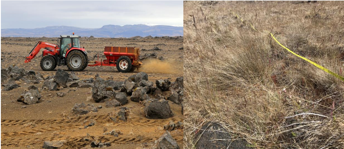
Figure 1. Spreading of bone meal at the Kot reclamation site and improvement in vegetation cover after 3 years of application. (Photo: Á. Þórisson, April 25, 2016).