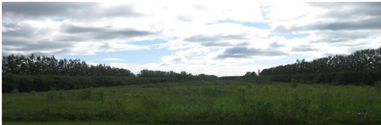
Figure 6. Shelterbelts in Gunnarsholt consisting of willows and poplars, used to lower wind speeds.