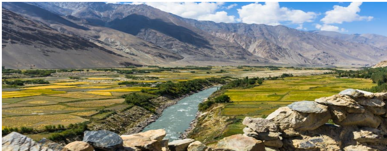
Figure 2. Agricultural land in the GBAO.

Tajikistan entered a crisis in all orders, including food and energy supplies, after the collapse of the Soviet Union. During the civil war, in the beginning of the 1990s, it was necessary to replace the coal with trees and shrubs, so many were cut and collected (Siegmar & Walter 2006). Still, in Tajikistan 80% of the households in rural areas rely on fuelwood as the main source of cooking energy (Djangibekov et al. 2015). According to Siegmar and Walter (2006), this anthropogenic factor led to land degradation by wind and water erosion around the villages. With increased erosion, the accumulation of sand has also increased. Both these factors have led to a loss of productivity and biodiversity of the soil. With the increase of soil erosion in the mountains, problems such as mud flows and huge avalanches were intensified. Also, some parts of eastern Pamir experience high salinity in irrigated fields. Eutrophication has become a challenge in areas where sheep, goats, cows and camels regularly rest. Gradual changes are manifested in the form of land use changes in the eastern and western Pamirs (Siegmar & Walter 2006).