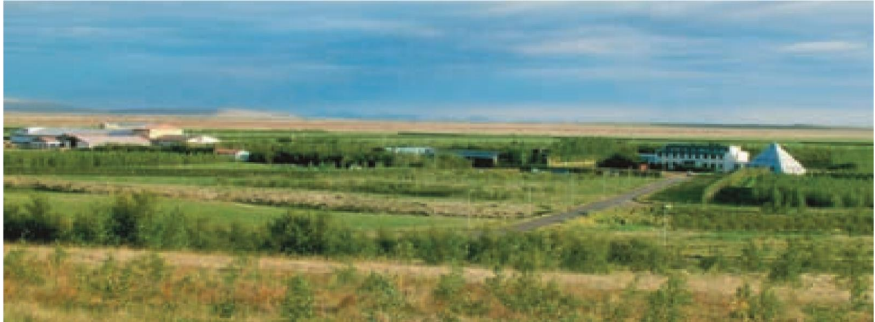
Figure 5. Gunnarsholt farmhouses and surrounding area in 1944 (top picture), and the Soil Conservation Service headquarters seen from the same point as above in 2011 (lower picture). (Source: Crofts & Olgeirsson 2011).

In Iceland, other methods are also being used to reduce sand drifts, such as artificial barriers and irrigation for wetting the soil surface and increasing cohesion. Fences are extensively used to manage or prevent livestock grazing during restoration, and barriers used to control rivers to reduce erosion of riverbanks (Crofts & Olgeirsson 2011).