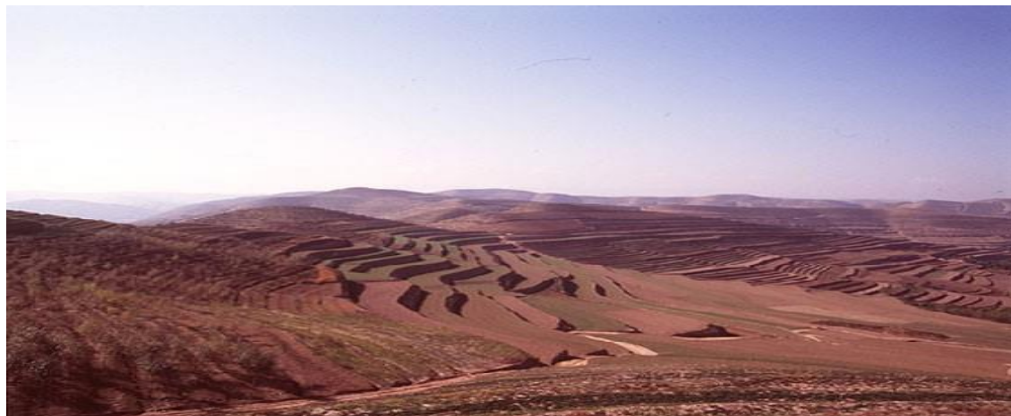
Figure 3. Terraces in China.

Mountain people adapting to difficult conditions at high altitudes have learned to survive by developing a sustainable system for agriculture, forestry and cattle breeding (FAO 1989). People traditionally built terraces for regulating water flow on steep slopes. The technique also leads to soil conservation and saves the land from degradation (Arnaez et al. 2015). This could also slow down the weathering of rocks and increase crop growth on steep slopes (Dorren & Rey 2004). This method is common in mountainous areas and is still used intensively for agriculture (Arnaez et al. 2015).