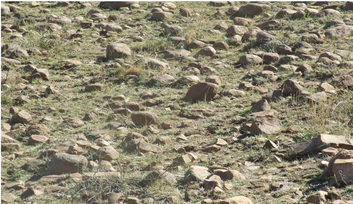
Figure 1: Example showing a grazing area which is considered stable because of the dominance of rock, since rangeland site stability is determined by measuring the amount of vegetation cover, amount of litter, amount of rock and amount of bare soil.

At Ha Masita, even though the rangelands are communal, they are managed by a grazing association and this might be the reason why the area is stable and with relatively good productivity. The association is managing the daily routines of grazing management and they have developed some strategies amending the traditional seasonal grazing into modified seasonal grazing by incorporating some form of rotation in their rangelands. The Mafeteng grazing area reflects a typical example of a seasonal grazing area with no rehabilitation programme or management modification. The results in Table 3 give a clear picture of the impacts of the traditional seasonal grazing system with both the plant species diversity and rangeland production being low. However, the site was considered to be stable only because rock is considered a form of surface cover (Fig. 1). Vegetation cover, litter and rock are considered as total cover.