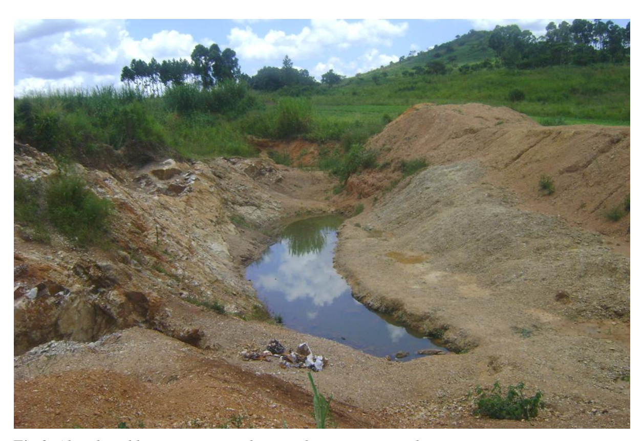
Fig 3. Abandoned borrow pit in Budongo sub-county, Masindi.

There are many documented cases of abandoned, unrestored borrow pits (see figure 3) and associated problems in connection with road developments in Uganda (e.g. Birabwa 2006; Aryaguka et al. 2007; African Development Fund 2009; Office of the Auditor General 2010; African Development Bank Group 2011; Uganda National Roads Authority 2011).