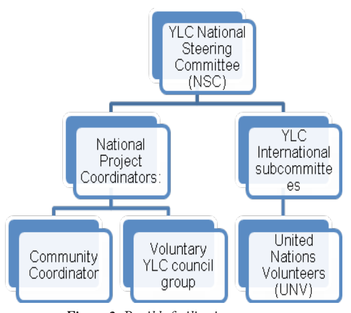
Figure 2. Possible facilitation structure

In bringing the above planning considerations together, it is important to have a framework to facilitate the process and to ensure that responsibilities are well shared. Such a structure will facilitate the planning for the Year's programme. The possible structure is indicated (Fig.2). The same structure could be followed in forming strong networks during the planning stage, and perhaps during the actual year, if successful.