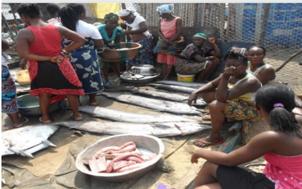
Figure 2: Women involved in processing fish as part of the fisheries value chain.

Fresh fish are normally preserved for a brief period by ice blocks for only a few hours during to the lack of electricity in most part of the fishing communities (Jueseah, Knutsson, Kristofersson, & Tomasson, 2020).