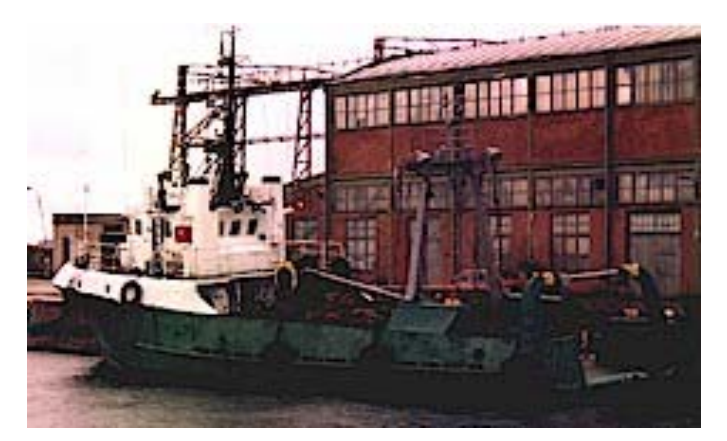
Figure 2: The main vessel type in the Baltic Sea is a small stern trawler - MRTK as show in this figure.