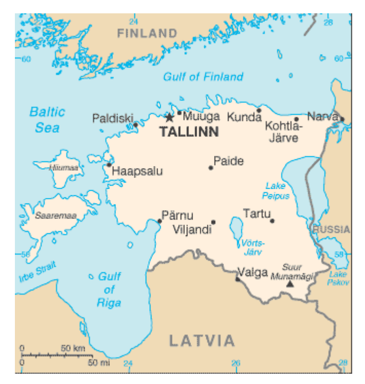
Figure 1: Map of Estonia, including the Gulf of Finland and Gulf of Riga (The World Factbook 2003).

The republic of Estonia is located on the east coast of the Baltic Sea. The land borders of Estonia are 663 km, including the border with Russia (294km) and the Republic of Latvia (339 km). Estonia covers 45,227 \text{ km}^2 . The most important fisheries resources are the Baltic Sea and inland waters. The coastline of the Baltic Sea is 3,794 km and territorial sea extends to 12 miles from the coast. Estonia has 1,521 islands in the Baltic Sea with a total area of 4,130 km<sup>2</sup> (about 9.1% of the whole territory). Figure 1 shows a map of Estonia. There are two big islands (Saaremaa and Hiiumaa) to the west, and that is where most of the fishing occurs. The Gulf of Riga and Gulf of Finland and the area around the islands are the most important areas for Estonian Baltic Sea fisheries.